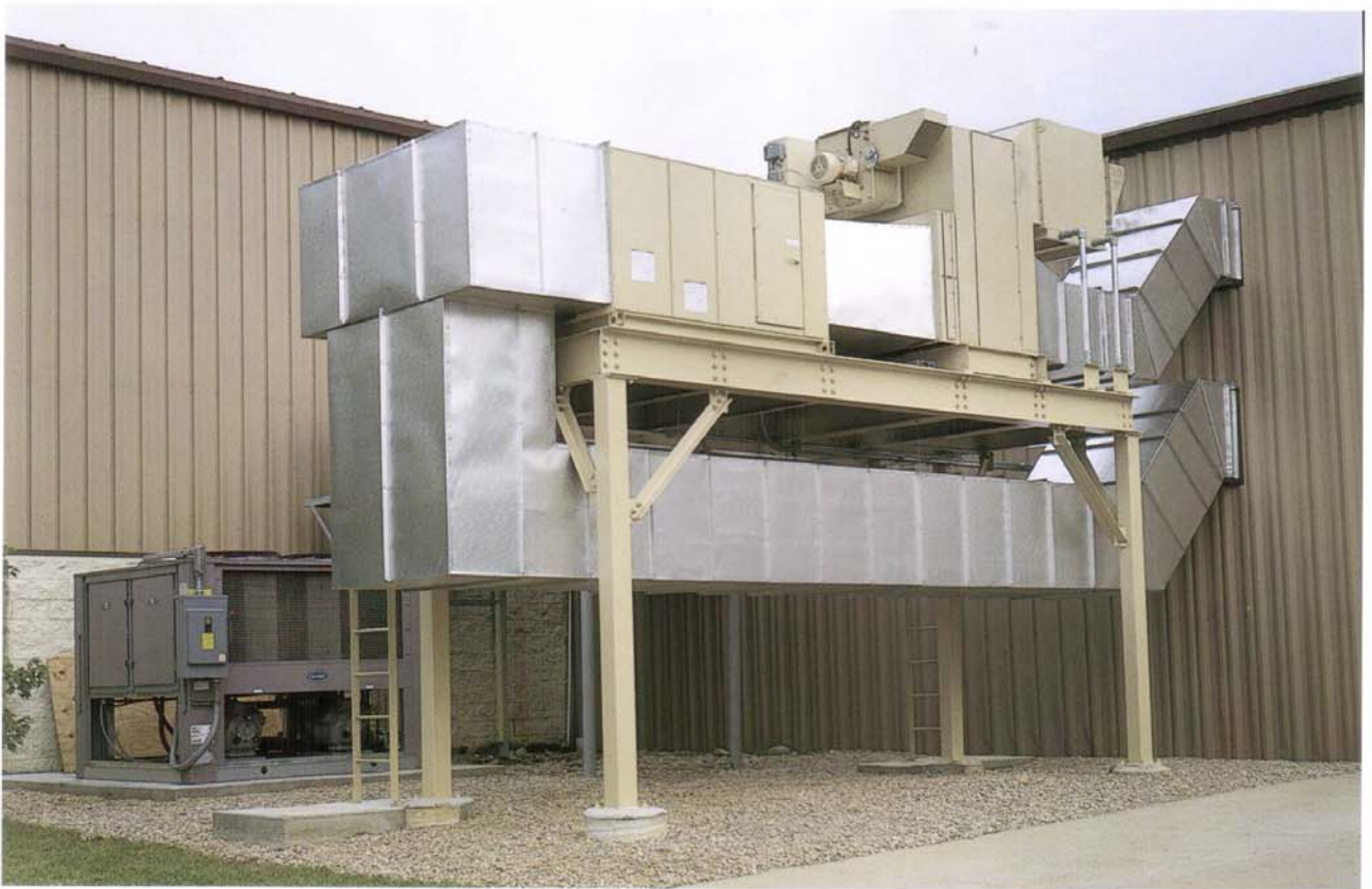
A Model THCD 8000 installed at Winn Packaging, a plastic blow-mold facility, located in Fairfield, Ohio