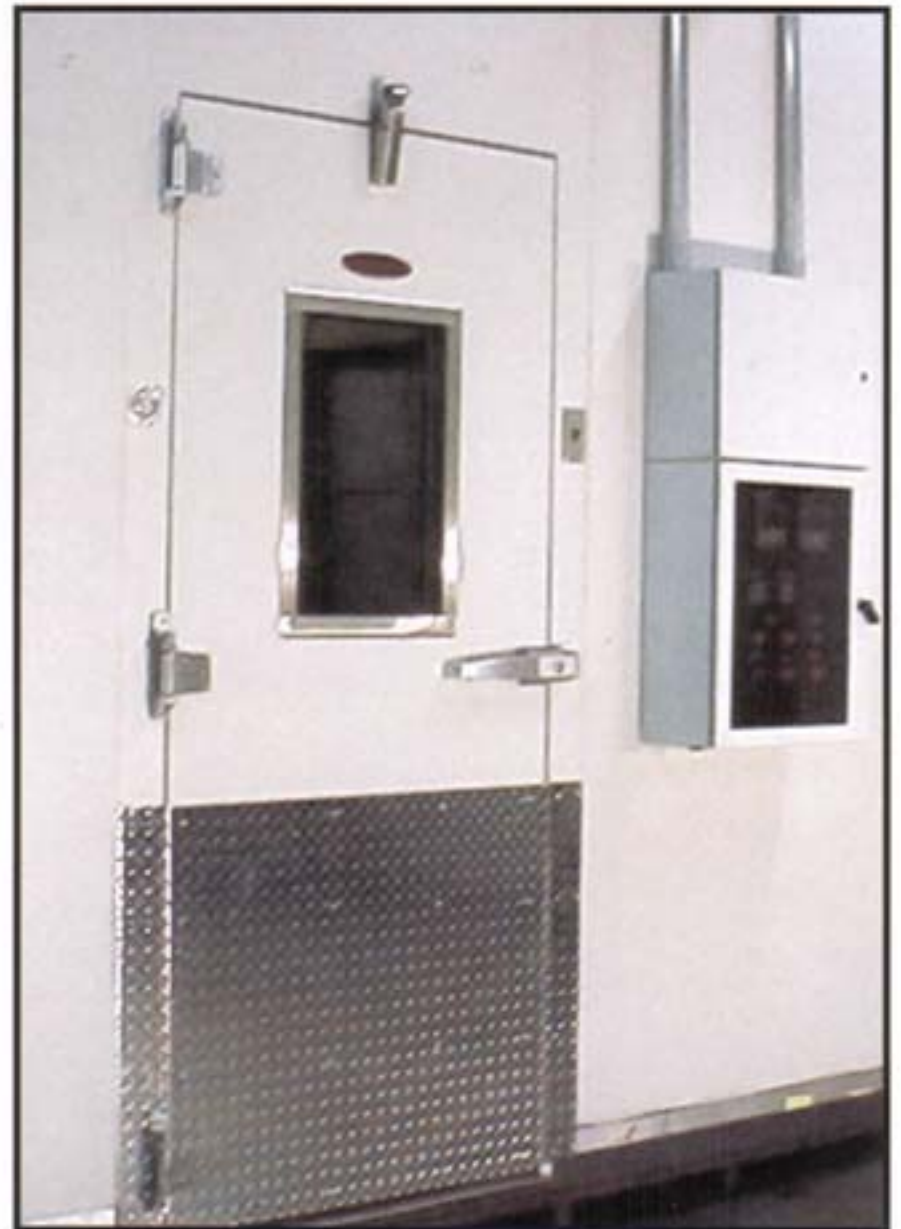
Standard accessories subject to change without notice